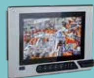
Industrial Panel PCs & Displays